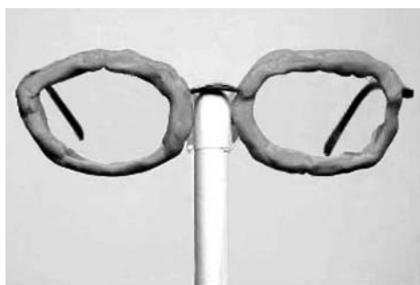
Figure 2 Tac 'N Stik® reusable adhesive around the edges of the eyeglasses used to prevent unmasking.

To assess the success of masking we asked the examiner to report what treatment he/she thought the child had received or if he/she was unsure. This question was asked after testing with the assigned reading glasses was completed. In addition, the children and parents were asked which treatment they thought they had received or if they did not know. The